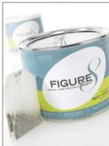
Figure 8® Daily Detox Tea assists the natural cleansing process of the liver and kidneys by helping the body to counteract, filter and clear toxins.* It's a gentle way to help the body clean itself by aiding the primary filtering organs: The liver and kidneys.* The Daily Detox Tea Blend cleanses and purifies, working to defend against the effects of less-than perfect dietary habits and environmental stress by providing antioxidant protection from free radical damage.*

Use for 3 days, then call your Arbonne Independent Consultant to shaRE your Results!